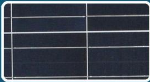
A-Class Solar Panel