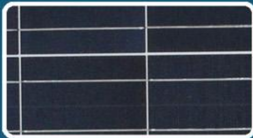
A-Class Solar Panel