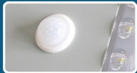
Human Body Sensor