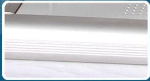
Aluminum Alloy Shell