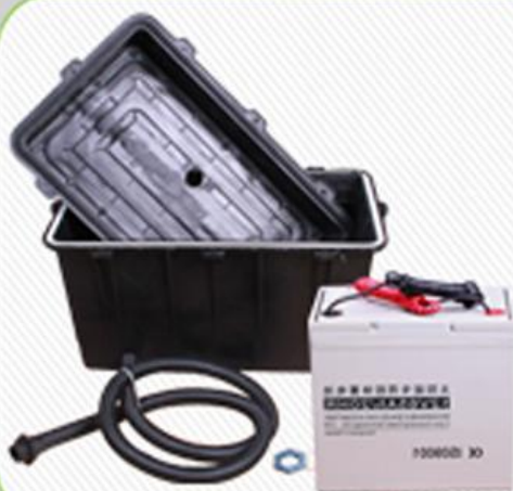
Battery and Box