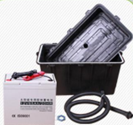
Battery and Box