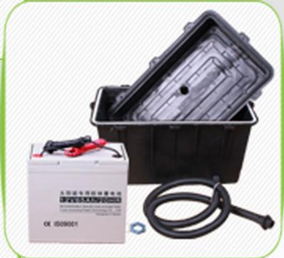
Battery and Box