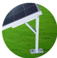
Fix PV Racks