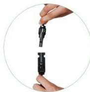
String Solar Panel