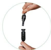
String Solar Panel